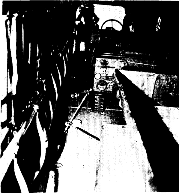
Figure 2. M151 1/4-ton truck and M100 1/4-ton trailer positioned and tied down. (View looking aft in helicopter.)