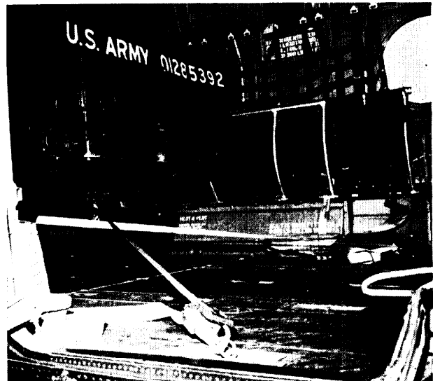
Figure 1. Typical tiedown of M100 1/4-ton trailer. (View through main cabin entrance door.)

Note. It is emphasized that the times given for the operations described in this manual are for guidance purposes only and may vary, dependent upon existing conditions.